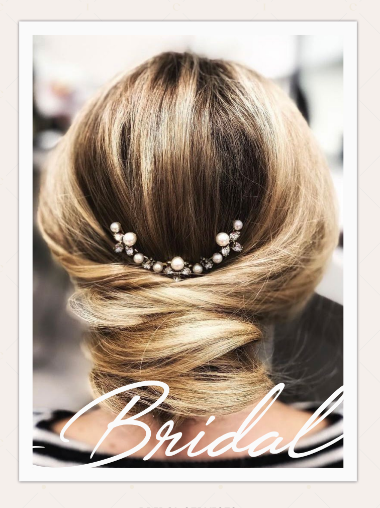
BRIDAL SERVICES Celebrating Over 50 Years of Weddings